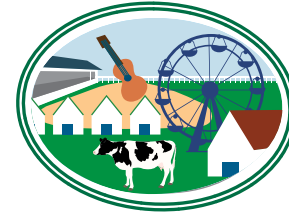
Bureau County Fairgrounds 1856