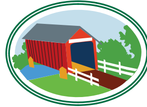
Red Covered Bridge 1863