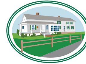
Owen Lovejoy Homestead 1838