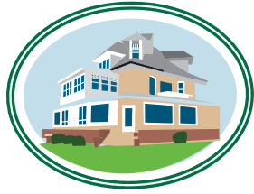
Bureau County History Center 1911